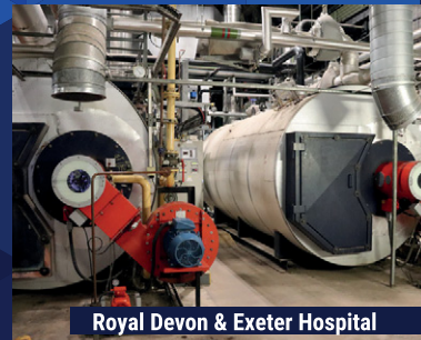
Royal Devon & Exeter Hospital